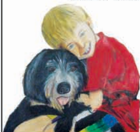
11 yrs Oil Pastel

Student's Name _____ Age ____ DOB _____ Class Title _____ Time _____